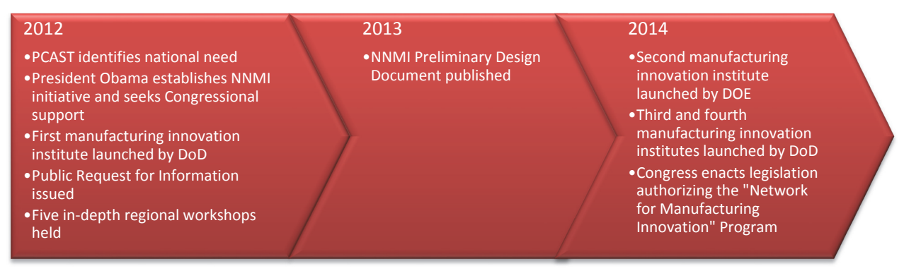
Figure 2. Chronology of Events Associated with NNMI Program Formation