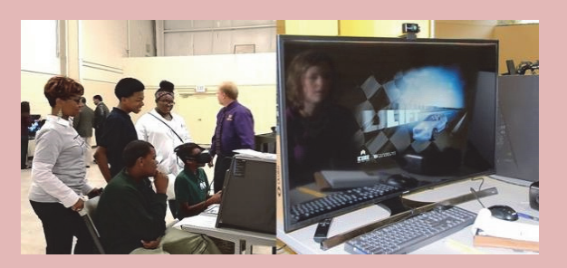
Figure 8. Launch of Virtual Reality Experience during Manufacturing Day 2015

To begin creating LIFT as a "learning lab" as well as a technology lab, LIFT developed with Tennessee Tech University a virtual reality experience to immerse students and workers in an automobile assembly line with the challenge to select lightweight metals for parts to build a vehicle with high speed and energy efficiency.