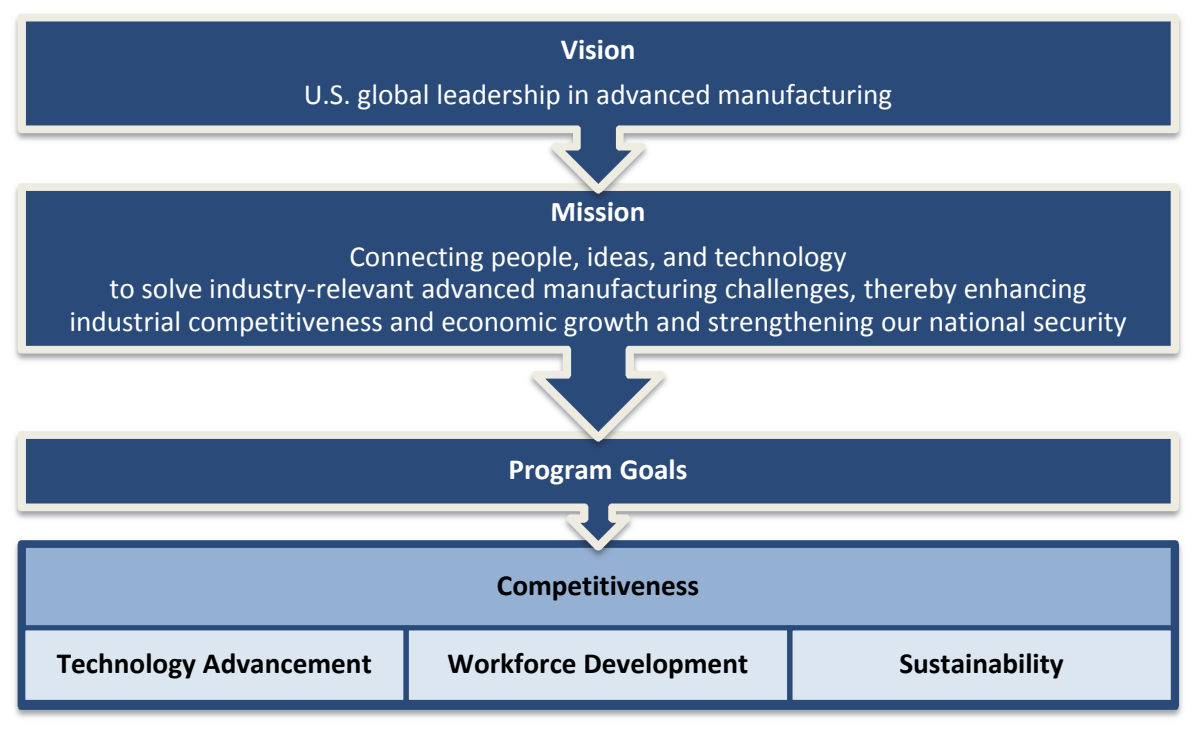
Figure 3. NNMI Program Vision, Mission, and Goals

The NNMI Program seeks to address the complex, manufacturing related technology transition challenges faced in the activity space that falls between early stage basic research and technology deployment in manufacturing. To provide ongoing focus and guidance for its stakeholders toward that end, a vision, a mission, and a set of program goals were developed over the course of 2015, as shown in figure 3.